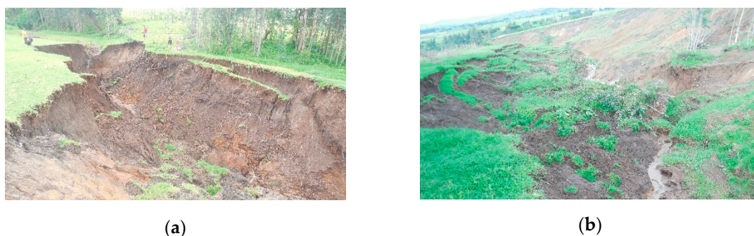
Figure 2. Schematic representation of typical valley bottom head-cut (a) and mass wasting phenomenon (b).

Tension cracks are also one of the important factors for gully bank instability [57] as gully mass wasting processes are commonly preceded by the occurrence of tension cracks [19]. On a valley bottom in semi-arid Kenya, tension cracks cause gully mass wasting by allowing more water into the cracks, increasing the soil pore water pressure [58]. Presence of cracks can, also, diminish the load-carrying capacity of soil by up to 30%, thereby affecting gully stability [59]. Thus, the evolution of valley bottom gullies (unlike hillside gullies) are directly linked to the concentration of the flow paths and the greater moisture contents, leading to periodically saturated soil. Saturation of the soil would destabilize gully banks [16], and fluvial processes carry away the unconsolidated sediment from the failed banks.